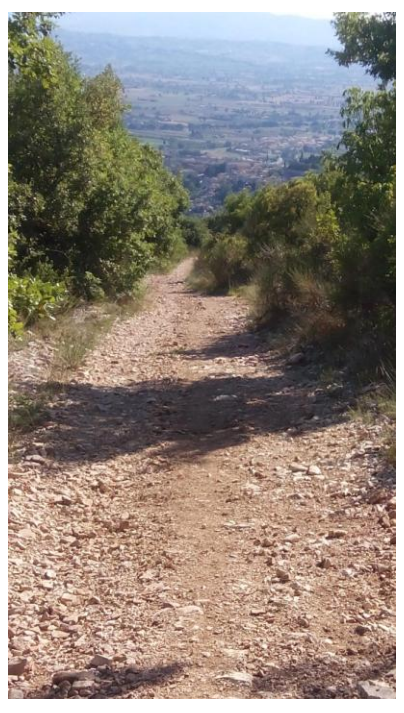
Trail near Spello, a town about 15 miles from Assisi.

After getting accustomed to the camino's physical demands, I soon found it exhilarating. The quiet mountain pathways and trails far removed from busy streets and noisy towns, the trail's hermitages or sanctuaries around what seemed every bend in the road or atop every mountain or hill, rendered it ideal for prayer and meditation.