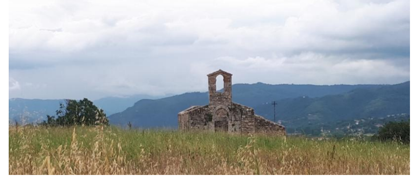
Chapel near the Rieti Valley.

The camino — and St. Francis — thus rewarded me with more than the prized testimonium certificate of completion; instead, I had received something more. Just as so many pilgrims before me, I realized that the pilgrimage was not merely a journey to a physical place; instead, the real journey was within and the destination was the Divine.